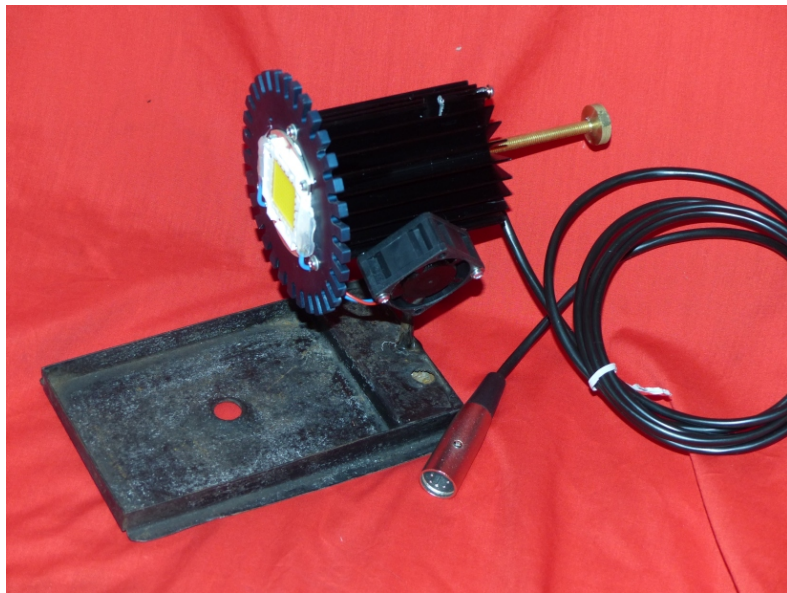
Typical Installation using the lantern's pole mount

There is a central 8mm hole running through the body of the CS341 unit to allow fitting to an existing pole support. The foot of the pole mount may need reversing from its original orientation to allow the CS341 to be moved to the correct distance for the condenser lens focal length.